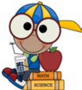
Infographic from understood.org