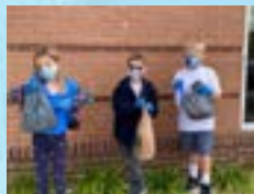
Thank you for keeping our campus clean!!